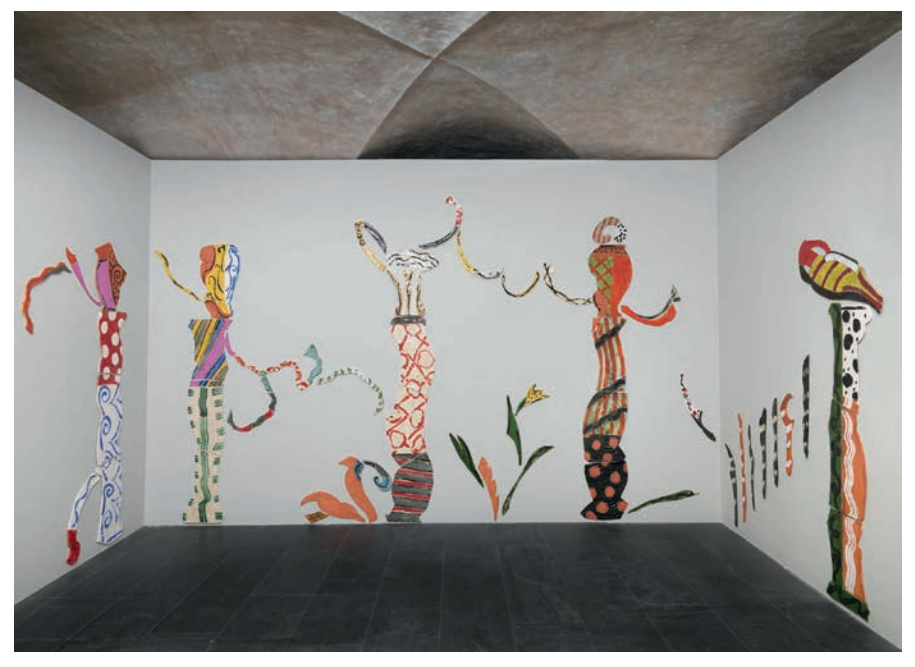
Betty Woodman, Of Botticelli , 2013. Glazed earthenware, epoxy resin, lacquer, and acrylic paint, 126 \times 384 \times \frac{3}{4} inches (320 x 975.4 x 1.9 cm) overall

The postmodern approach of Memphis was announced at the 1981 Milan furniture fair, where Ettore Sottsass's Casablanca Sideboard (1981) was first exhibited. This figurative, arm-waving shape decorated with a plastic laminate "germ" pattern shares a sense of subversion and humor with Samaras's chairs. Nathalie Du Pasquier's Royal (1983) chaise combines simple form with exuberant surface decoration. In it, Memphis's germ-pattern laminate mixes with two upholstered fabrics: one designed by fellow Memphis designer George J. Sowden and the other by Du Pasquier, called Cerchio. The latter's charismatic patterns of the era are characteristically flat, graphic, and color-charged, infused by an embrace of traditions from Africa and India, cubism and futurism, art deco and graffiti. One of Du Pasquier's drawings, made for a 1984 Memphis-themed Bloomingdale's shopping bag,